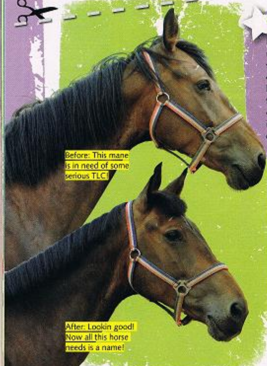
Before: This mane is in need of some serious TLC!