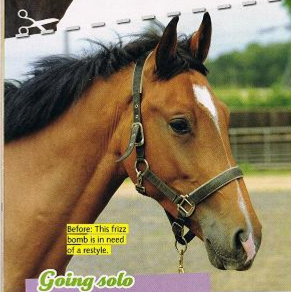
Before: This frizz bomb is in need of a restyle.