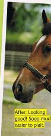
After: Looking good! Sooo much easier to plait.

4. Lorraine finishes trimming the braid. This is where the headpiece sits.